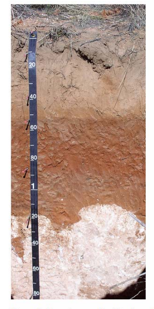
Brownfield series profile (Cochran County, TX)