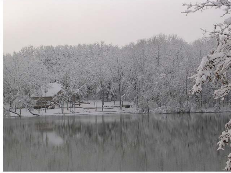
Snow and Water (Mt. Pleasant)