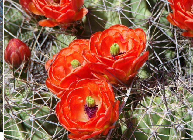
Blooming cactus in area of Chispa soils (north of Van Horn, TX)