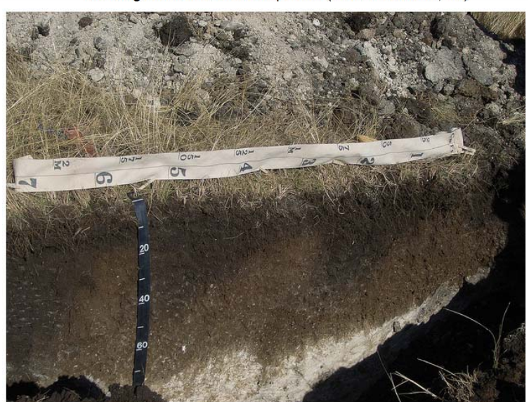
Vertisol (Bosque County, TX)