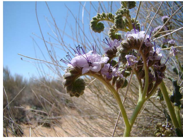
Blue curl on sandsheet in area of Copia soils, (north of Fort Hancock)