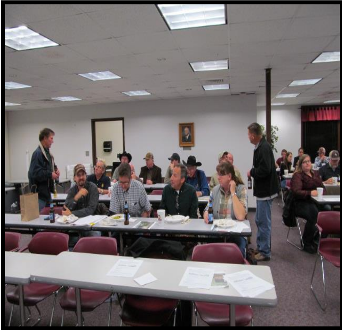
PSSAT Annual Meeting, dinner anyone?