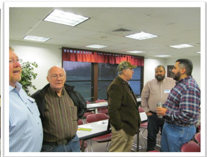
PSSAT members and guests enjoying the Social Time.