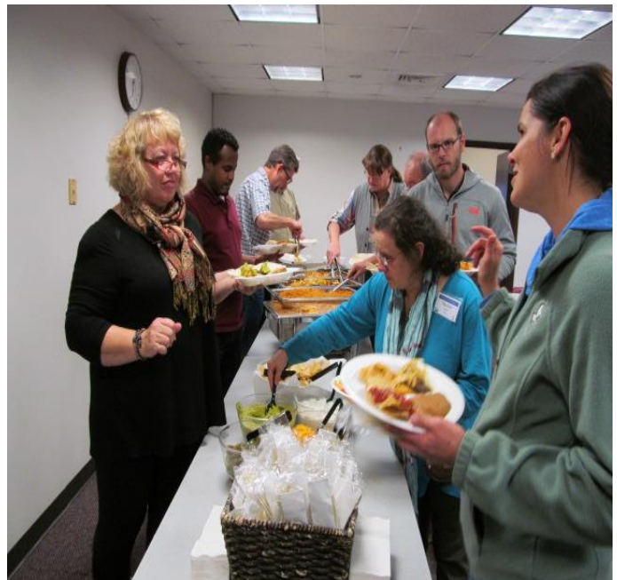
Meal time at PSSAT Annual Meeting. Wow, are those Fajitas with all the trimmings?