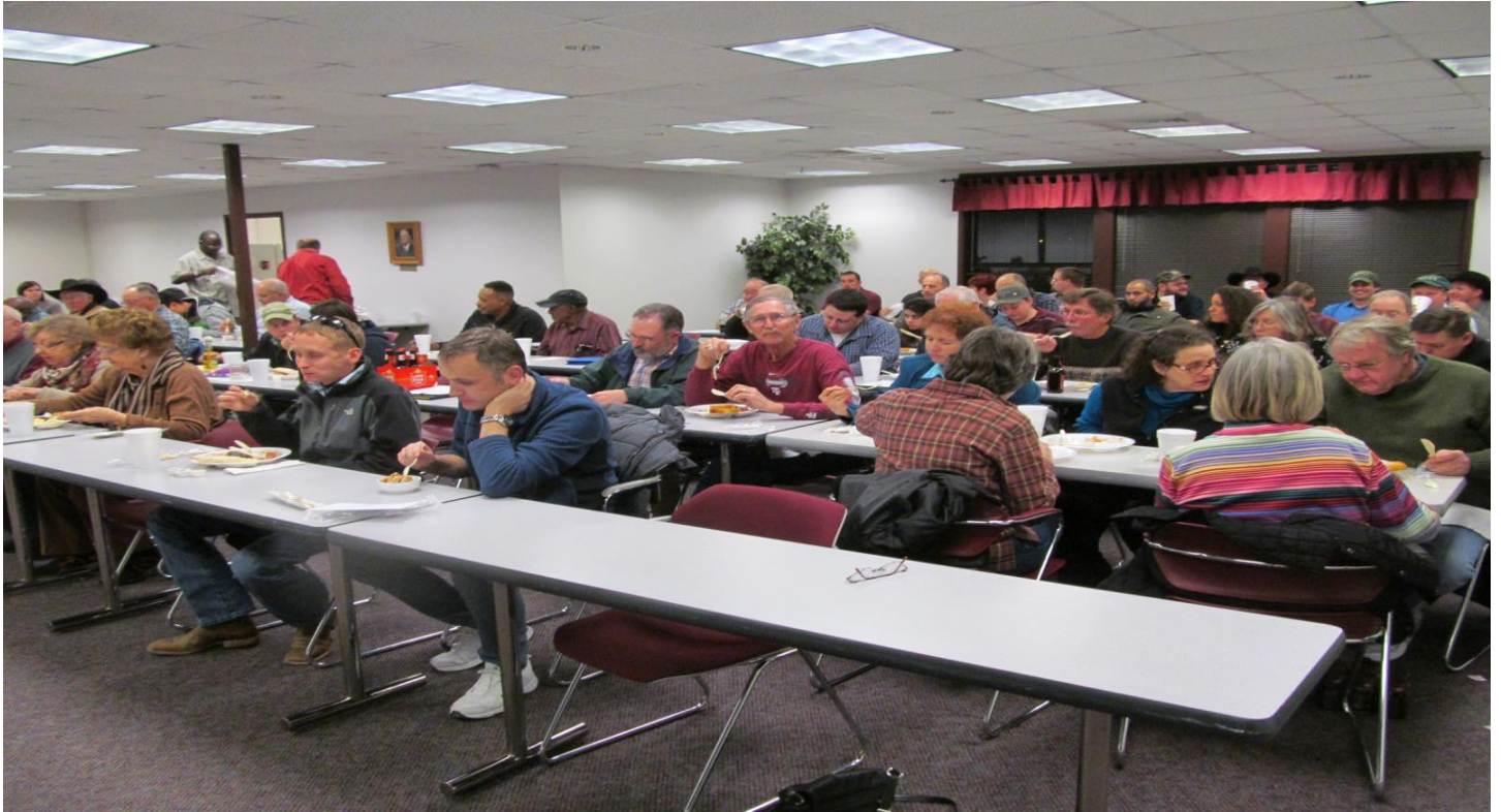
PSSAT Annual Meeting, G. Rollie White Visitor Center, some of the members at dinner.