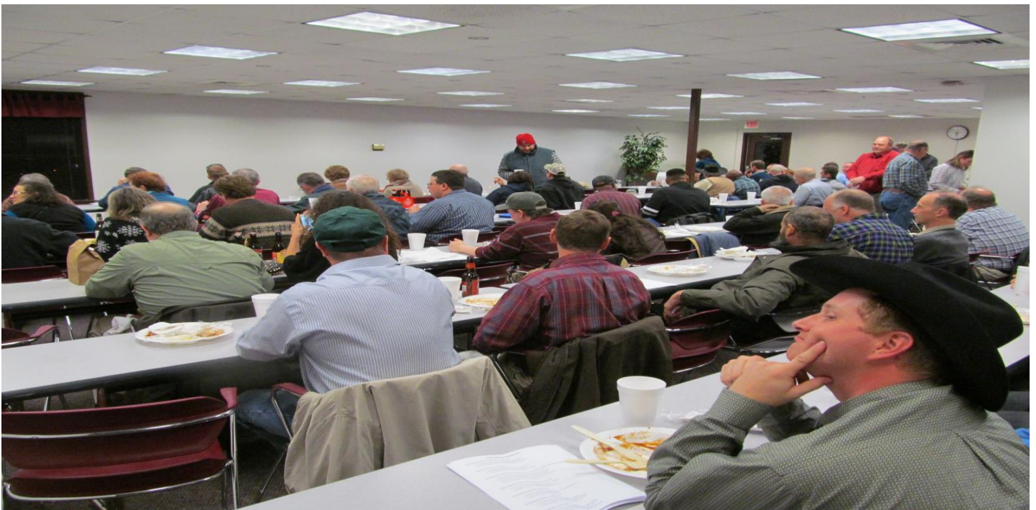
PSSAT Annual Meeting, scenes from the back row. Who is hamming up the photo?