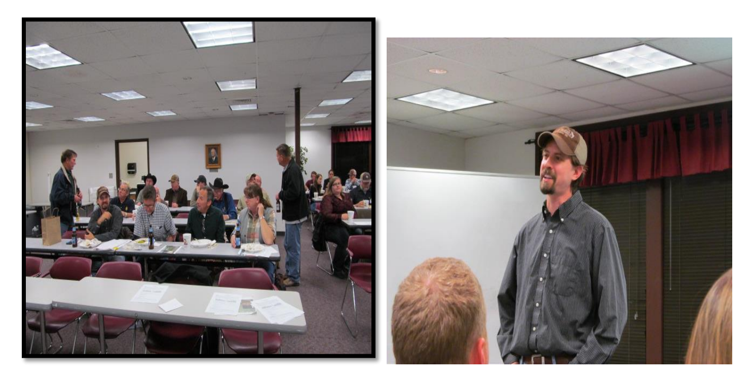
PSSAT Annual Meeting, dinner anyone?