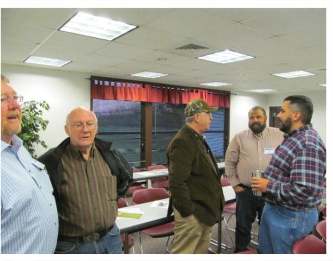
PSSAT members and guests enjoying the Social Time.