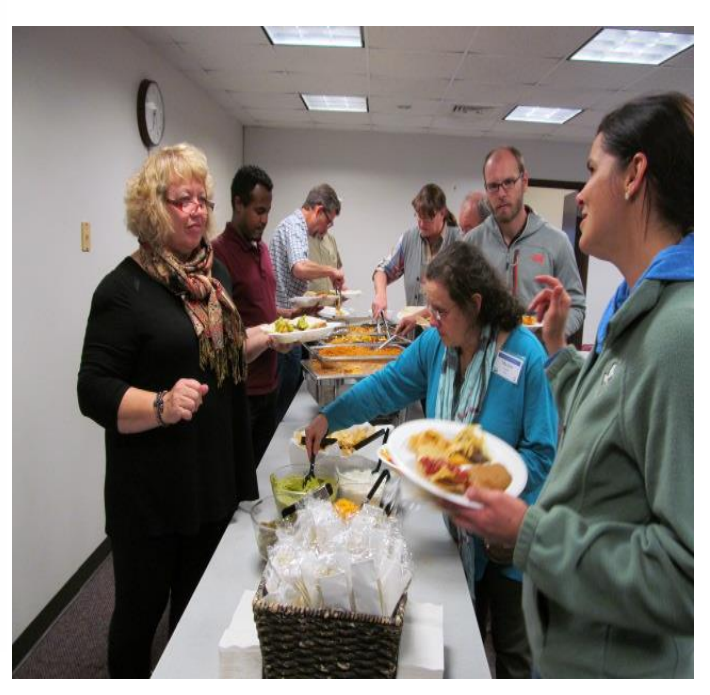
Meal time at PSSAT Annual Meeting. Wow, are those Fajitas with all the trimmings?