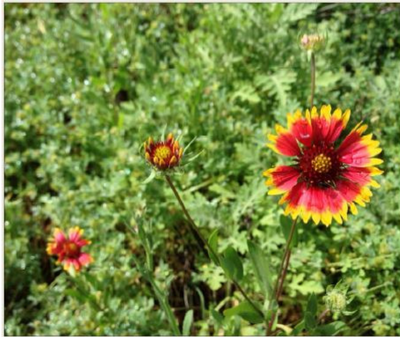
1 st Place (Flora/Fauna): John Sackett