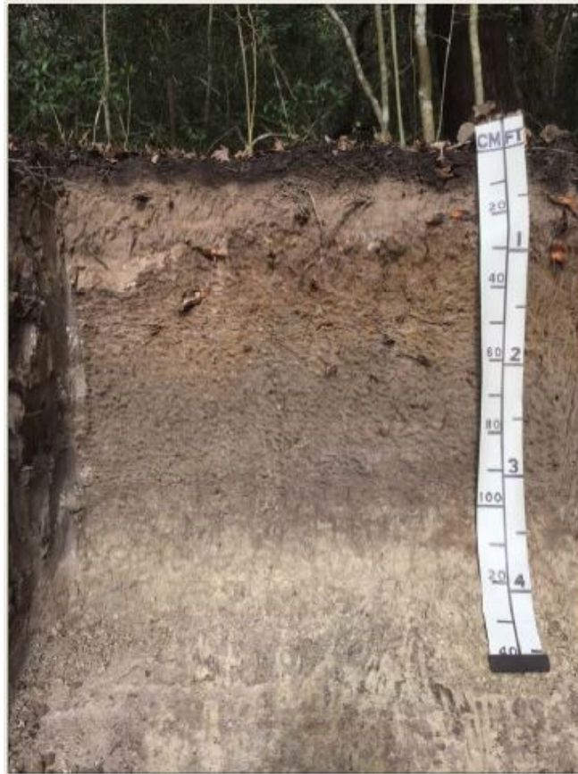
3 d Place (Soil Profiles): Dennis Brezina