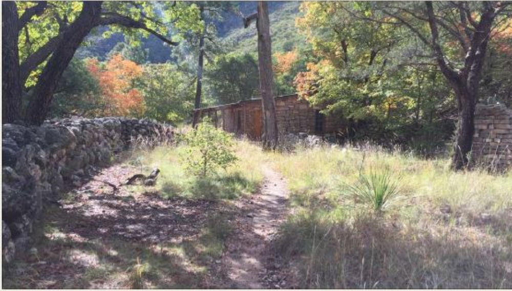
2 nd Place (Miscellaneous): Chance Robinson